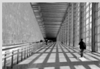
Zane Kuo: Second