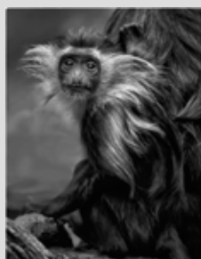
Anastasia Tompkins: HM